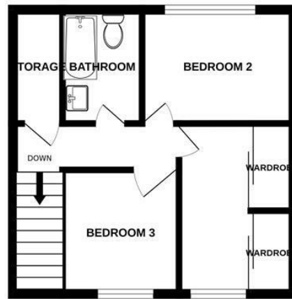
1ST FLOOR 283 sq.ft. (26.3 sq.m.) approx.